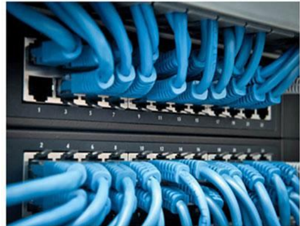
Fig.3. local area networks (WANs) Connection

universities and buildings use the technology for establishment of local area networks (LANs).